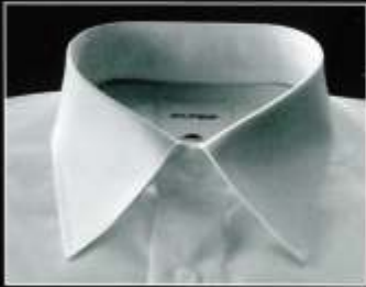
Kent Kent Kent