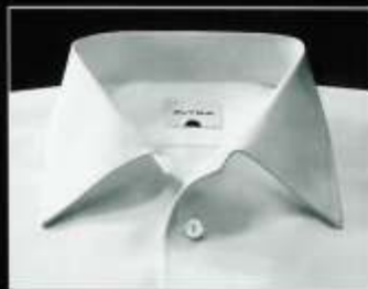
Elbe Elbe Elbe