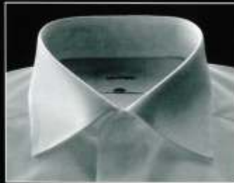
New Kent New Kent Nouveau Kent