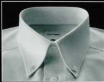
Button-Down Button-down Pointes boutonnées