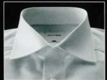
Haifisch Cutaway Italien