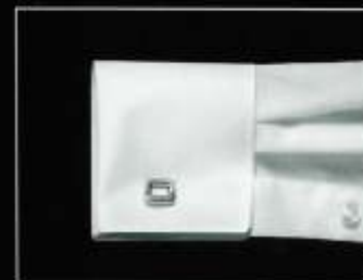
Umschlag Double Mousquetaire