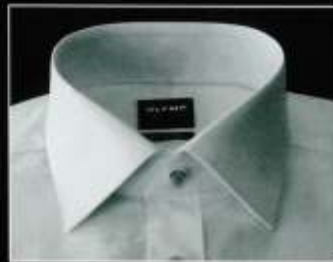
Italian Kent Italian Kent Italian Kent